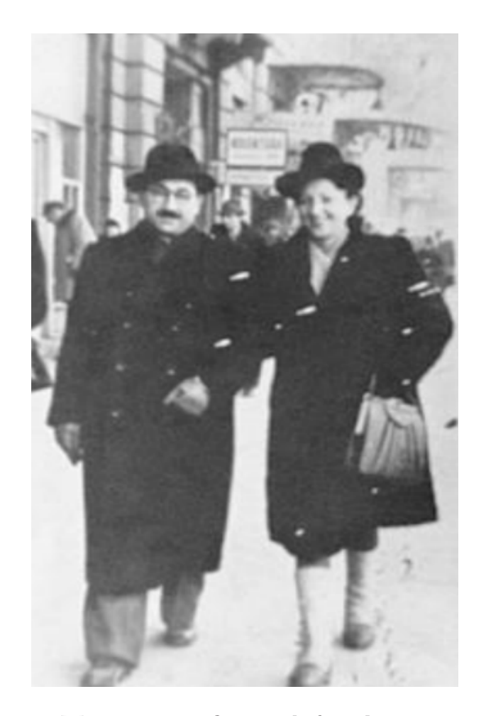
My parents in Cracow before the war.