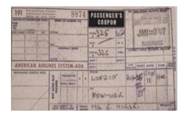
One of our plane tickets from London to New York.