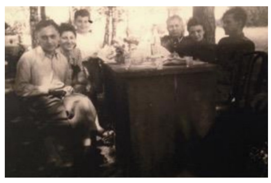
From the left: an unknown man, my mother, and I. On the right are two Russian soldiers and a government official. We looked at the Russians as our saviors and friends.