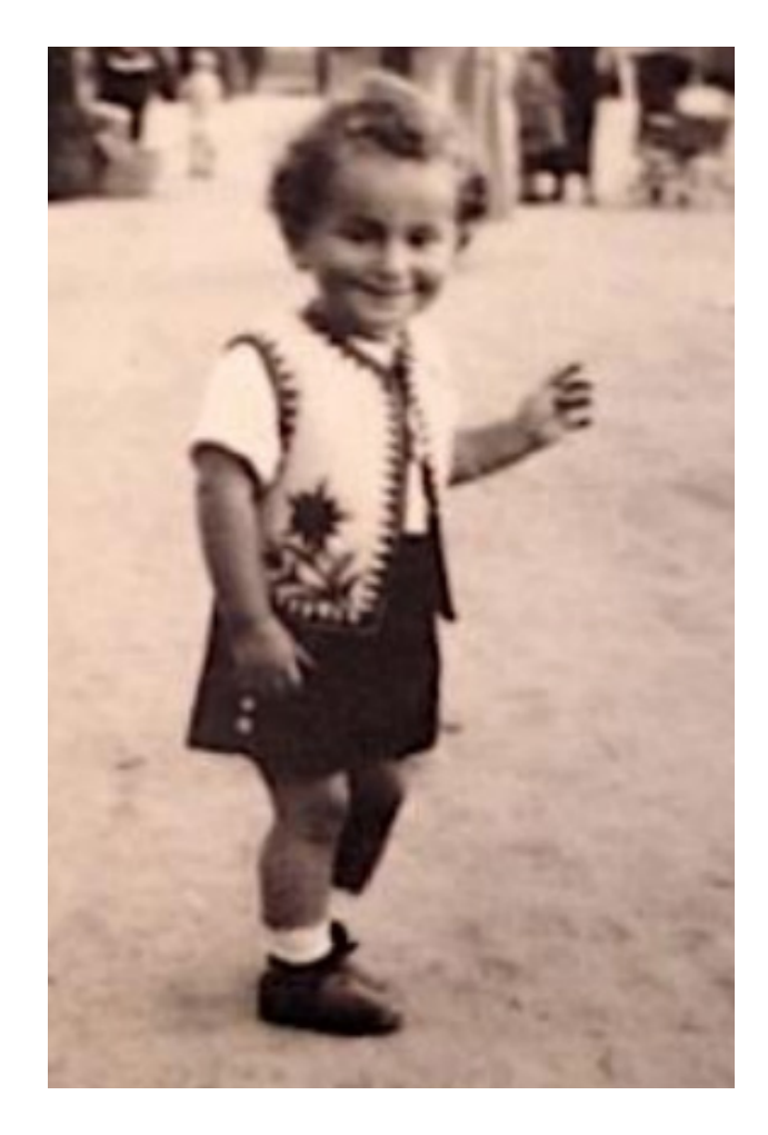
As a child in Cracow.