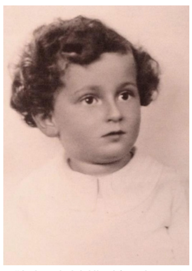
I had an ideal childhood from the time I was born until 1939.