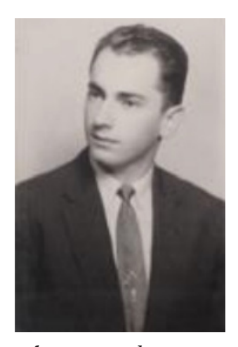
As a young lawyer.