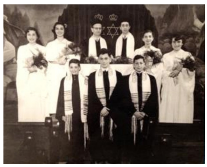
My Bar Mitzvah in Newburgh, New York. I am in the middle of the front row.