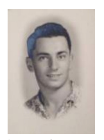
As a young businessman.