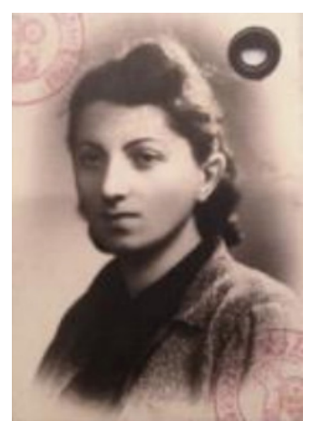
My mother's passport picture after she arrived in the United States.