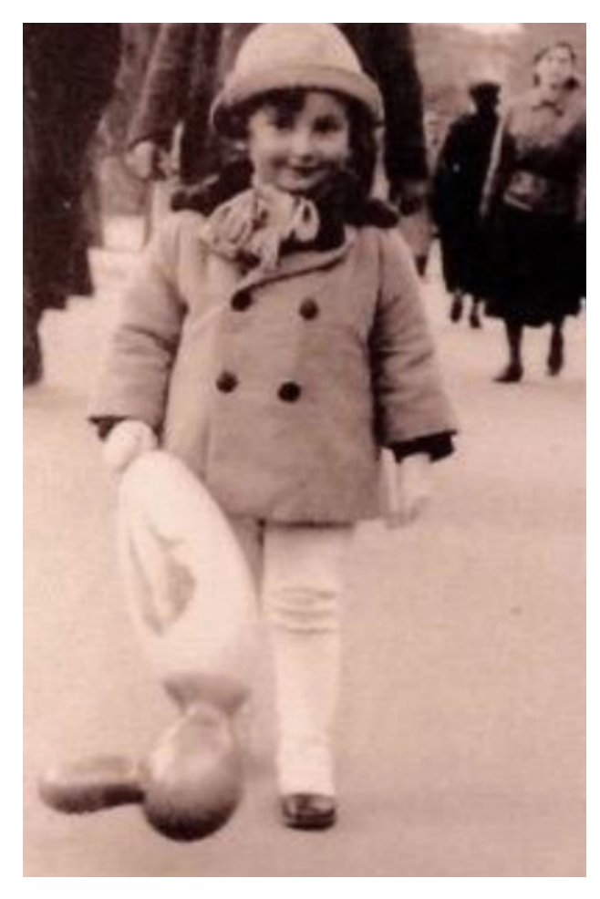
As a child in Cracow.