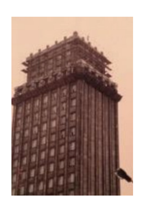
Our office windows were under the ledge, one row down.