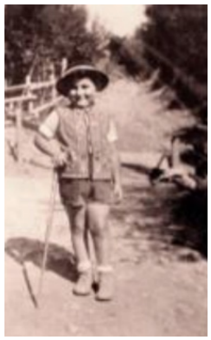
On vacation in the Carpathian Mountains.