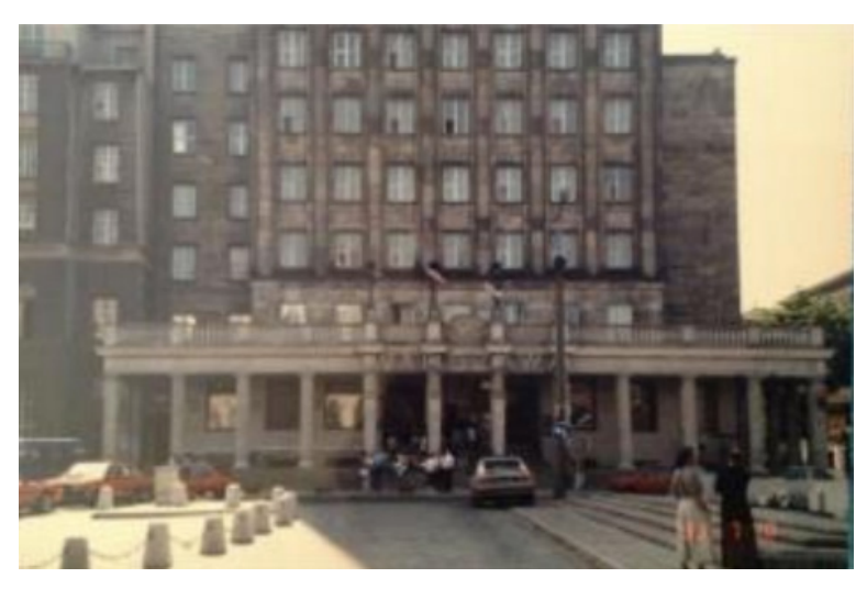
The Drapacz, the building where my mother and I hid in a closet for two years. The Nazi Air Force occupied the top two floors. Warsaw, Poland.