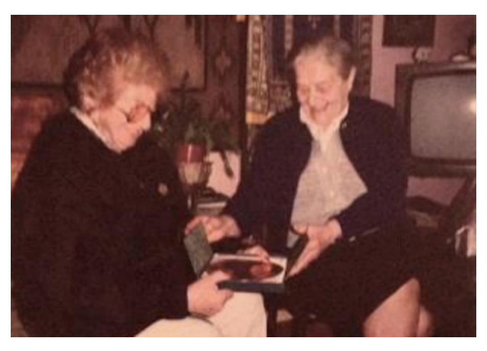
My mother visiting with the woman who, with her family, was living in the apartment we lived in before the war. Cracow, 1993.