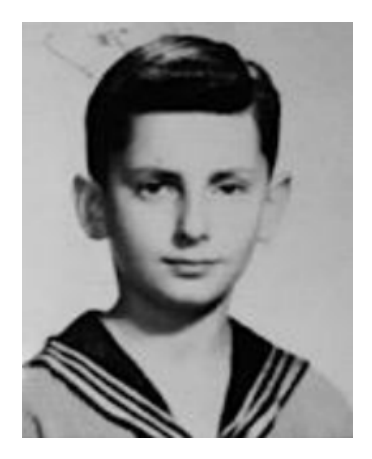
Before leaving Poland.