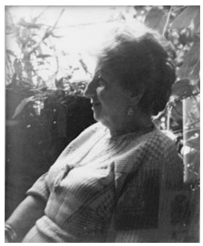
My favorite picture of my mother.