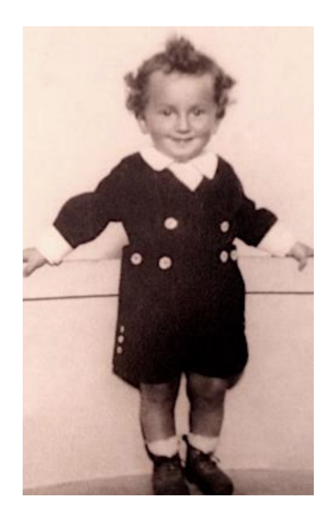
I led a charmed life as a child in Cracow.