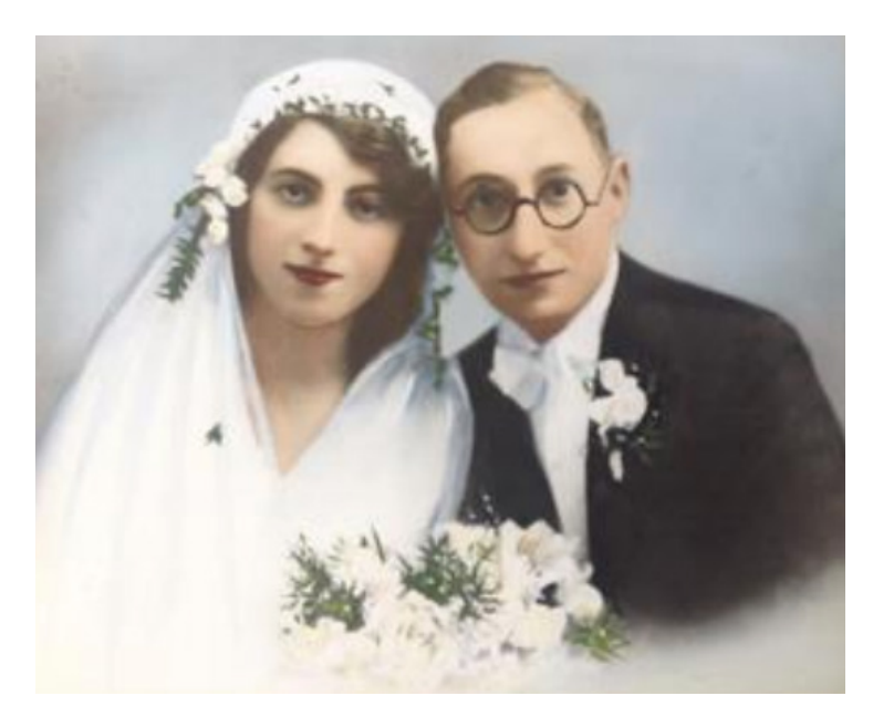
My parents on their wedding day. Cracow, Poland.