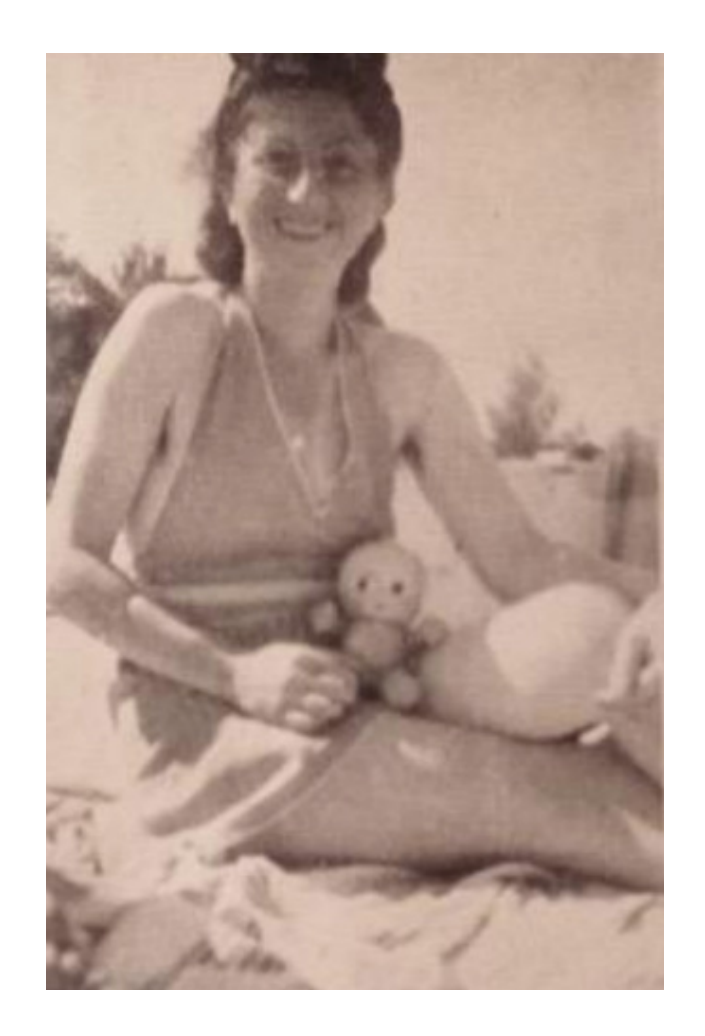
My mother at the Baltic seashore.