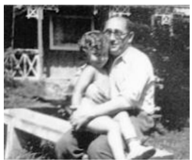
With my father in Poland