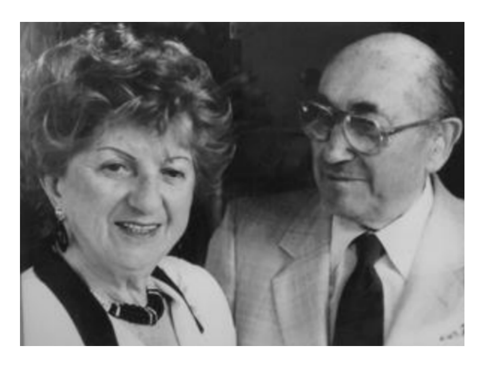
My father loved my mother until the day he died. You can see it in his face.