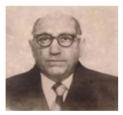
My father after the war.