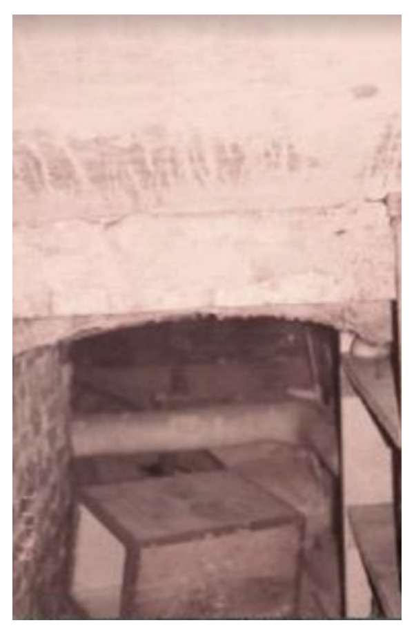
This is probably the coal bin in the bomb shelter where my brother was born.